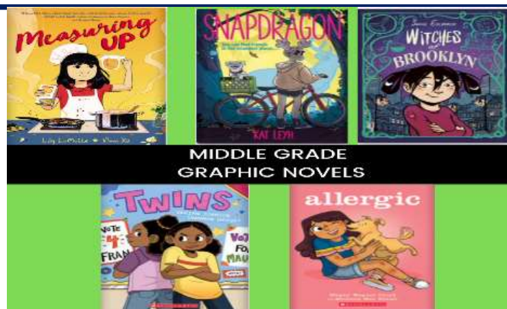
Fig 1. Graphic novels for Middle Grade

Reading literature promotes students' knowledge of English as a second language of culture and society (Schank, 2006). This knowledge is not easily acquired from other sources; it is too complex to capture any part of the interpretive writing. Language is related to culture (Horwitz & Klippel, 1986). In other words, the language is the bearer of cultural messages. As such, literature is very important when employed in language teaching. Literature is culture. The novels are often based on the perspective of one major personality suffering from developmental pain (Jacobs, 2021). This makes reading literary texts a radically different experience from reading interpretive articles, the most common type of literature in reading English as a second language (O'Connel, 2009). There is no doubt that "the English language curriculum is a place to enjoy and think about (Goodwyn, 2000).