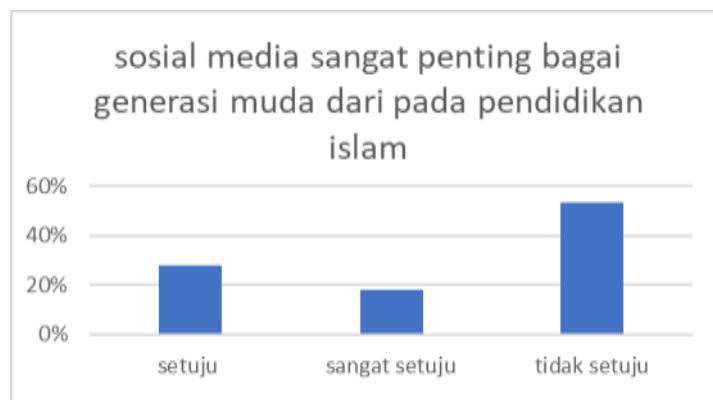
Figure 4. Social media is more important for the younger generation than Islamic education.

Regarding the diagram above that those who strongly agree are 55% and those who agree are 42% and those who disagree with the above statement are 3%. It can be concluded that many people strongly agree with the statement made by the researcher above, the teacher is aware that Islamic education in schools has decreased greatly due to social media. Therefore, teachers at school guide the younger generation not to do social media too often because social media can cause harm to the younger generation. So that the younger generation does not do bad things, the school must apply to students to study Islamic education. If Islamic education has been applied at school, the younger generation can teach people who do not know about Islamic education.