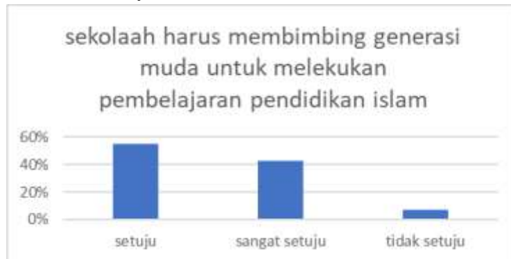
Figure 3: Schools must guide the younger generation to learn Islamic education.

Regarding the diagram above, we can know that people who strongly agree as much as 50% and who agree as much as 43% and who disagree as much as 7%. It can be concluded that many people strongly agree with teaching Islamic education to the younger generation, basically learning Islamic Islamic education is done by teachers teaching material about Islamic education to the younger generation. So that the younger generation does not fall into bad behavior because Islamic religious teaching is needed by parents, teachers and also for the younger generation. In order for the younger generation to understand and explore Islamic education as a whole, the younger generation must learn Islamic education wherever they are.