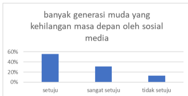
Figure 6. Many young people are losing their future to social media.

The results of the above research can be seen that many people strongly agree and agree with the above statement and there are even people who disagree with the above statement. People who strongly agree with the above statement are 45% and people who agree are 42% and people who disagree with the above statement are 13%. It can be concluded that many people strongly agree with utilizing social media for Islamic education because in social media people can also study Islamic education. Therefore we must be able to utilize social media today, so that the younger generation is not left behind with technological advances. If people are able to take advantage of social media then that person can already learn more about Islamic education, for example about fiqh education, because the material in fiqh contains many lessons that can keep us from falling into bad deeds and despicable behavior.