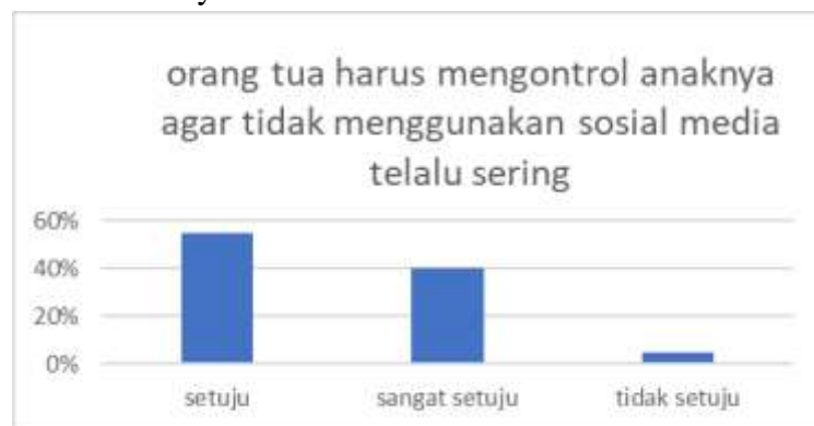
Figure 7. Parents must control their children so that they do not use social media too often.

It can be seen from the percentage above that many people agree with the statement above, there are 58% of people who agree with the statement above and 32% of people who strongly agree with the statements made by researchers and 10% of people who disagree with the statement above. It can be concluded that people who strongly agree and people who agree with social media can eliminate the future of the younger generation. Because in social media there is a lot of negative content that makes the younger generation lazy to study because he has been influenced by social media, therefore parents must be able to take care and pay attention to their children so that their children have a bright future and can make their parents proud. If their children are too focused on social media, their children's future will be threatened and their children will shame their parents and family.