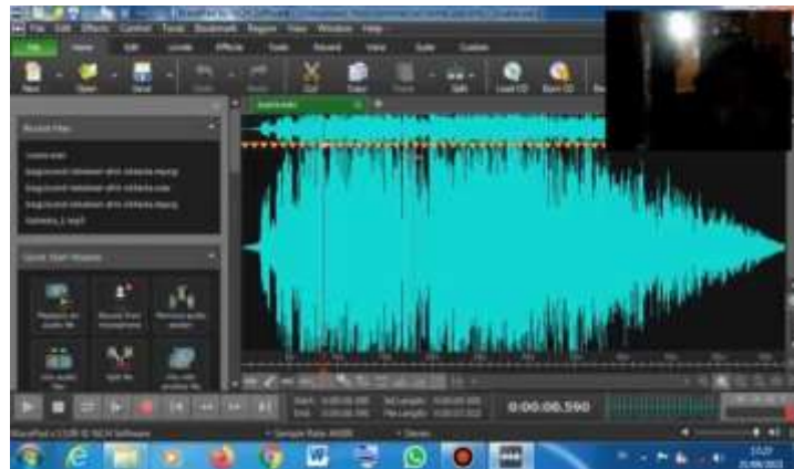
Figure 6. Menu Copy