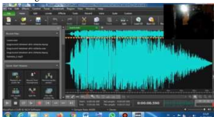
Figure 4. Introduction to the Record Menu