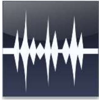
Figure 1. Wavepad Logo

This is the wavepad application logo that can be obtained via google which we will then download on the laptop.