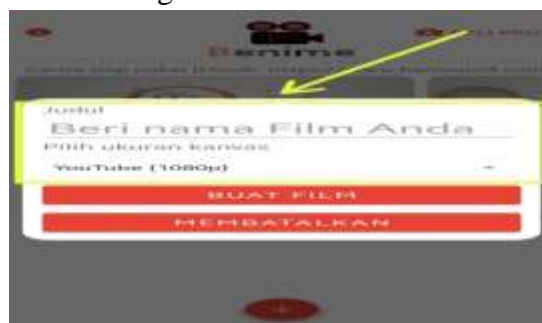
Figure 2. Title Creation

In figure 2, we can create a title according to what video we make, and for the canvas choice consists of several choices including: Youtube (1080p), Youtube (720p), Instagram (16x9), TikTok (1080p), TikTok (720p), Vimeo (1080p), Facebook (720p).