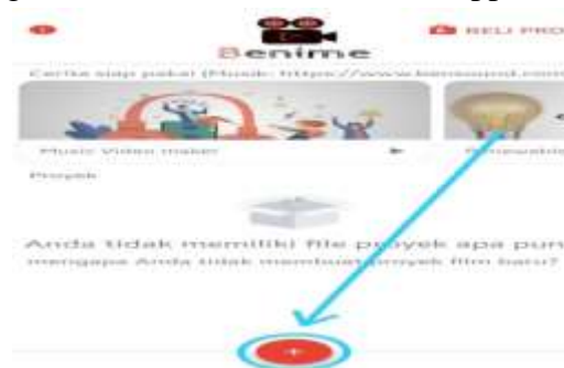
Figure 1. Interface of the Benime application

Figure 1 Represents the front view of the benime application once installed, and the arrow indicating on the + button or symbol serves to create a new project.