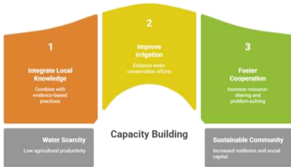
Figure 2. Capacity Building Transforms Rural Community

capital within this community illustrate the power of capacity-building approaches in creating sustainable, community-driven solutions to complex challenges.